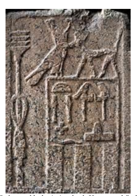
Only serekh depicting both Horus and Seth

The successor to Seth-Peribsen was Khasekhemwy, whose name means "The Two Powerful Ones Appear." This is him above. He was the last king of the second dynasty and he too has a distinction. He is the only Egyptian ruler with a serekh that includes both Horus and Seth. A depiction of which we can see here